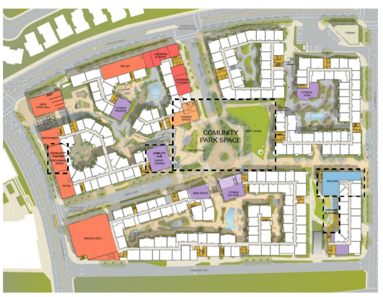
EXHIBIT C SITE PLAN FOR PUBLIC BENEFIT FACILITIES

GRAPHIC DEPICTION OF LOCATION OF PUBLIC BENEFIT FACILITES